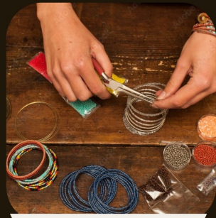
MEMORY WIRE BRACELET: $5

Sign up soon for the September Arts & Crafts Day on Friday, September 8th at 9:30 am . Make one project or both!