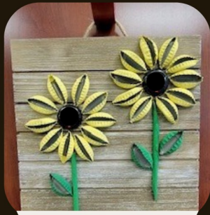
BOTTLE CAP ART: $3